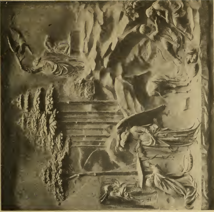
ABRAHAM AND ISAAC